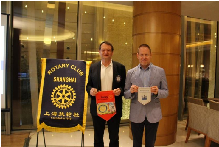
Handing over the club banner is serious business indeed.....