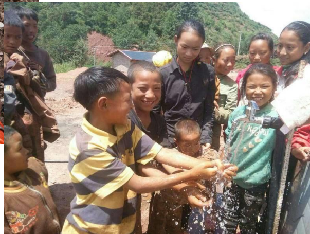
Water is arriving at the school