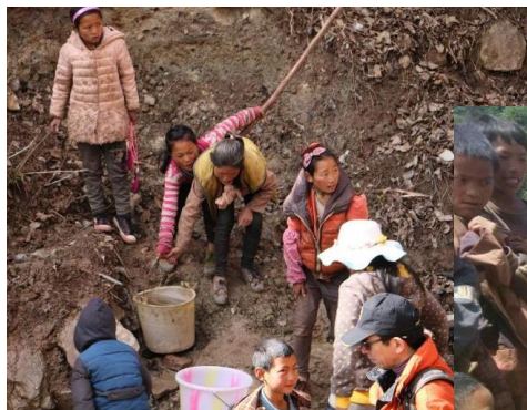
Before the project, villagers needed to walk 2km to the water source

The site visit on project completion is planned for September 28 th to 30 th . Interested Rotarians and friends please contact Alejandro or Terry for joining ( alejandrob.rotary@smlchinaconsult.com ; terrychu_prn@msn.com )